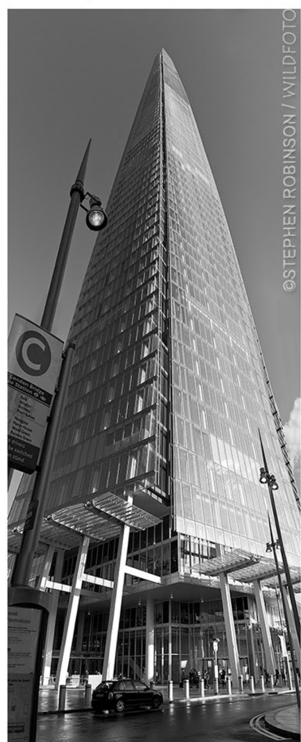
Leica M Summilux 35mm/f2.0 ASPH

This time , the first in a series of PhotoMails on shots from four of the big cities of Europe - Amsterdam, Berlin, London & Paris. It's quite startling just how different they are, each with it's own distinctive character. The shots are impressions of each city as created by its people, streets, buildings, cafe-life and art & culture. First up, some of the buildings, their architecture & design and how they are used.