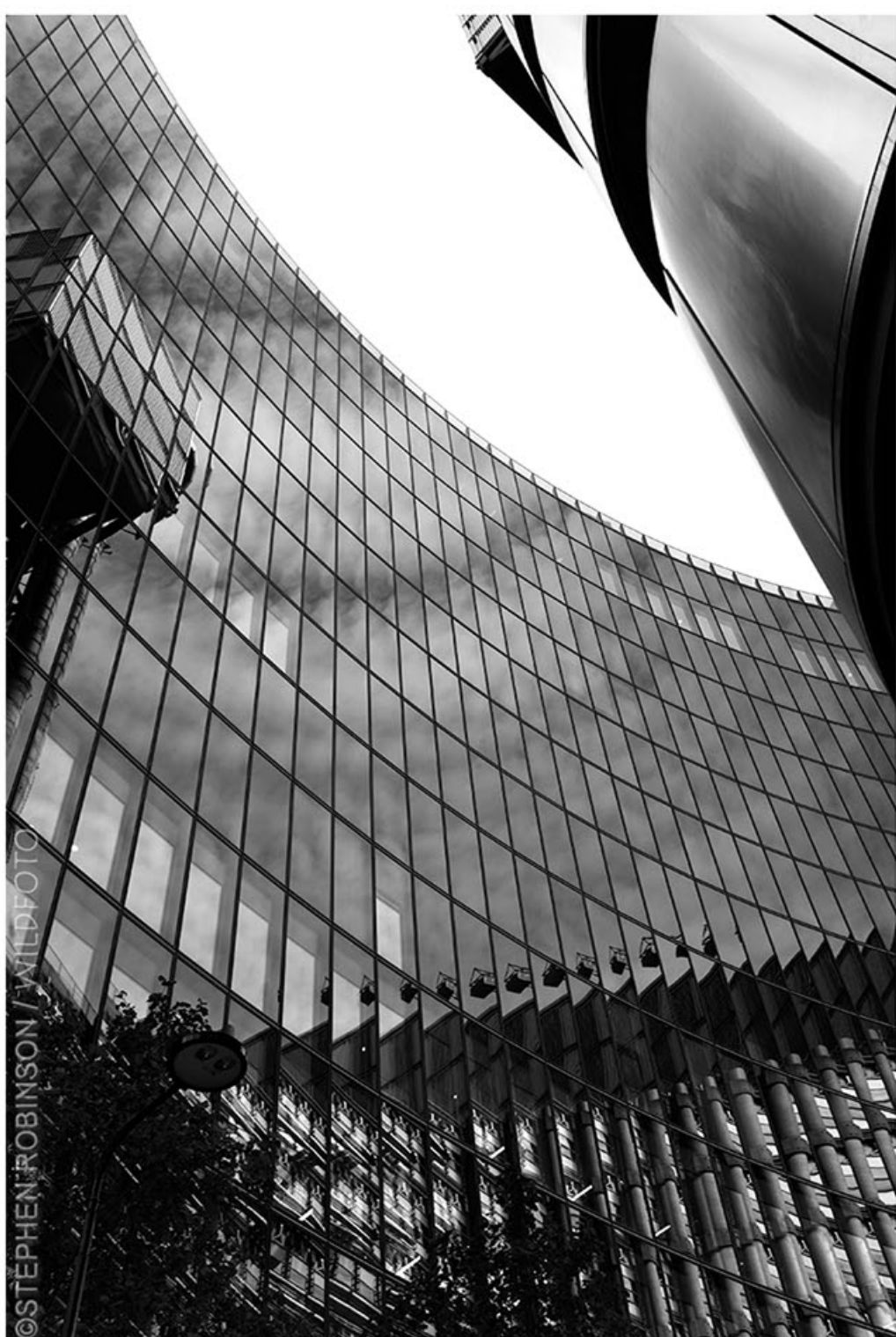
Leica M Summilux 35mm/f2.0 ASPH

It has 306 flights of stairs and 44 lifts (elevators) and if you are a family of 4 and want to enjoy the spectacular view from the observation deck some 244m (800ft) up, the ear-popping ride will cost you ZambianKwacha 696,000. Now you know.