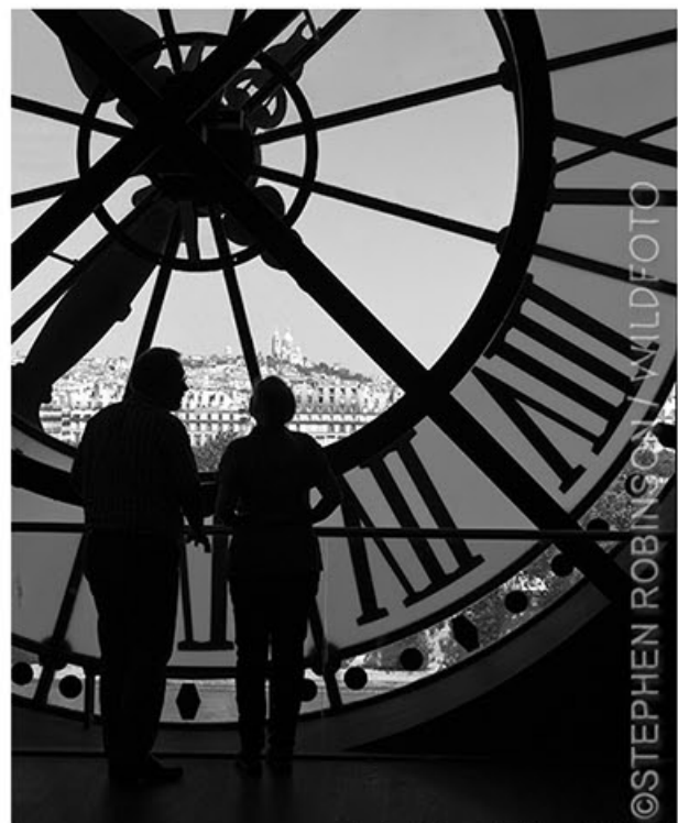
Leica M Summilux 50mm/f1.4 ASPH

Always keep your camera dry. The Heron Tower, London - with the UK's largest private aquarium.