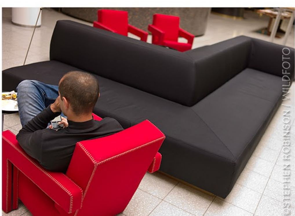
Leica M Summilux 35mm/f2.0 ASPH

You have to queue to get a shot of this. The clock tower in the Musee D'Orsay, Paris. The Montmartre hill and the Sacre Coeur church (pictured above) can be seen in the distance.