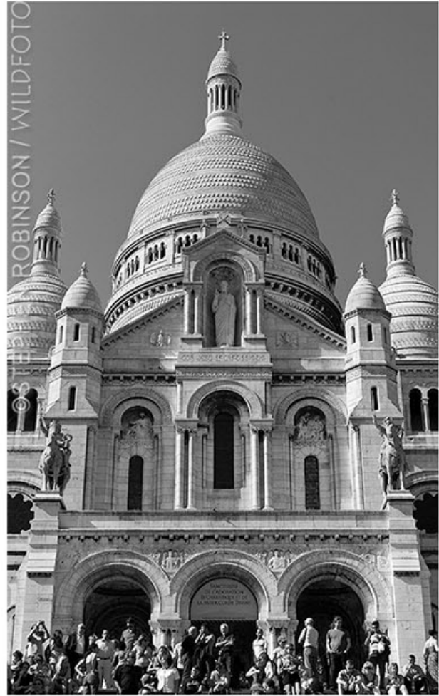
Leica M Summilux 50mm/f1.4 ASPH

The somewhat wacky Lloyds Building (it seems to have all its plumbing on the outside...) reflected in the grand Willis building in the City of London's square mile. Obviously there's a lot of money to be made selling insurance.