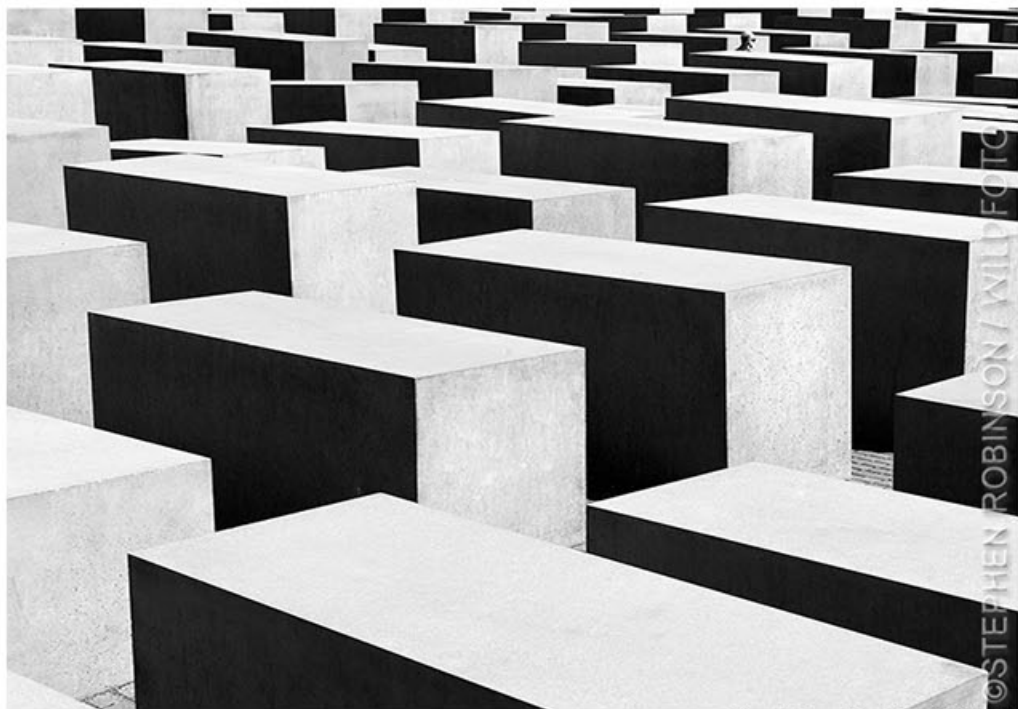
Leica M Summilux 50mm/f1.4 ASPH

Berlin's Brandenburg Gate. The bicycle is the most photogenic machine of all time. Do it in black & white, and it's timeless.