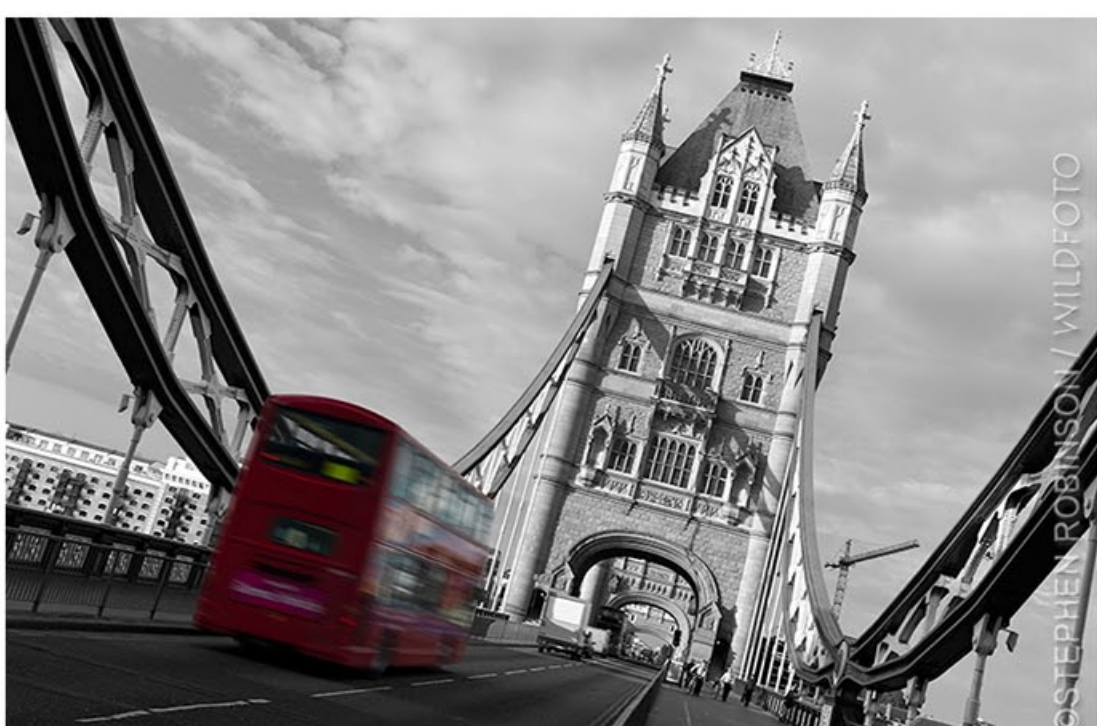
Leica M Summilux 35mm/f2.0 ASPH

EMAIL: wildfoto@wildfotoafrica.com TEL: +260 966 992999