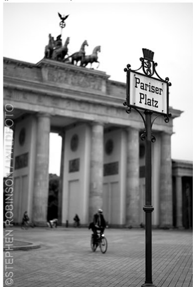
Leica M Summilux 50mm/f1.4 ASPH

Amsterdam, the interior of one of its hotels dedicated to modern design.