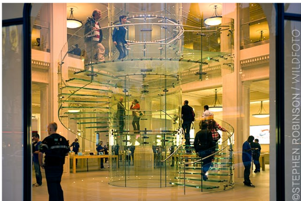
Leica M Summilux 35mm/f2.0 ASPH

The grand splendour of Paris - the beautiful Basilica of the Sacred Heart of Jesus of Paris (Sacre Coeur) atop Montmartre. A "tortured history" meant that it took some 39 years to build, reaching completion only in 1914.