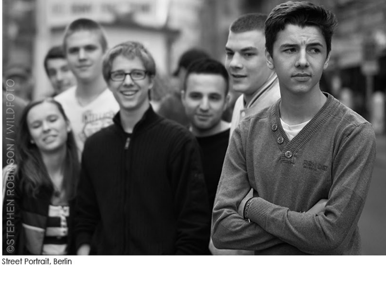
Street Portrait, Berlin

Probably the most visited spot in Berlin. To stop emigration from the Eastern (communist) bloc to the West, East Germany (GDR) collaborated with the Soviet Union to build the Berlin Wall. The wall was built as from 1961 and it was designated the official crossing point between East and West Berlin for foreigners and Allied Forces members. It was the site of the 1961 'Berlin Crisis' when American and Soviet tanks faced-off against each other. The Berlin Wall became an infamous barrier aimed at stopping escape from the Soviet-controlled communist East to the 'free' West. After the wall was opened in 1989 and Germany reunified in 1990, Checkpoint Charlie became a major tourist attraction. It is the site of the Mauermuseum (Wall Museum), which is both a fascinating record of Berlin's turbulent history and a remarkable testament to the courage and resilience of Berlin's people.