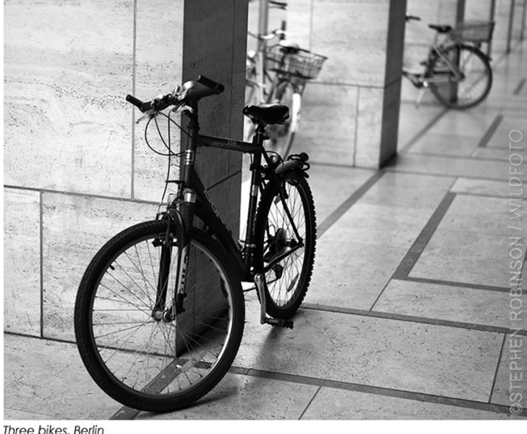
Three bikes, Berlin