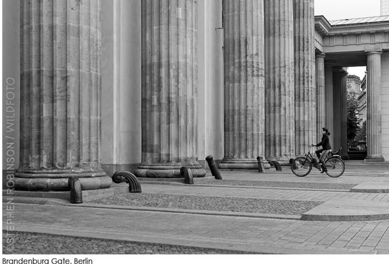
Brandenburg Gate, Berlin

Photo tip: I think this photographer was doing it just right. She had seen her picture, taken her camera position, framed the likely shot, and was just waiting, unnoticed and anonymous, ready for that extra something that will make the shot. Then raise the camera and capture the instant.