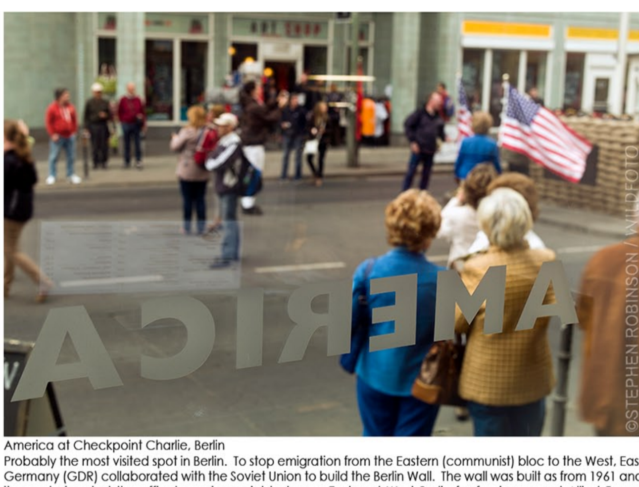
America at Checkpoint Charlie, Berlin

Photo tip: The same technique here. See the shot, frame it and wait for your subject to come along.