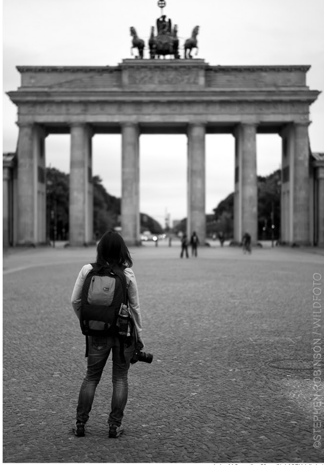
Brandenburg Gate, Berlin Leica M Summitlux 50mm/f1.4 ASPH (all shots)

In this PhotoMail, some impressions of the character (and characters) of Berlin, as shown by life and scenes on the city's streets. Included are some more photography tips on how to get better shots, whether your camera is the latest pro blockbuster or a simple point-and-shoot.