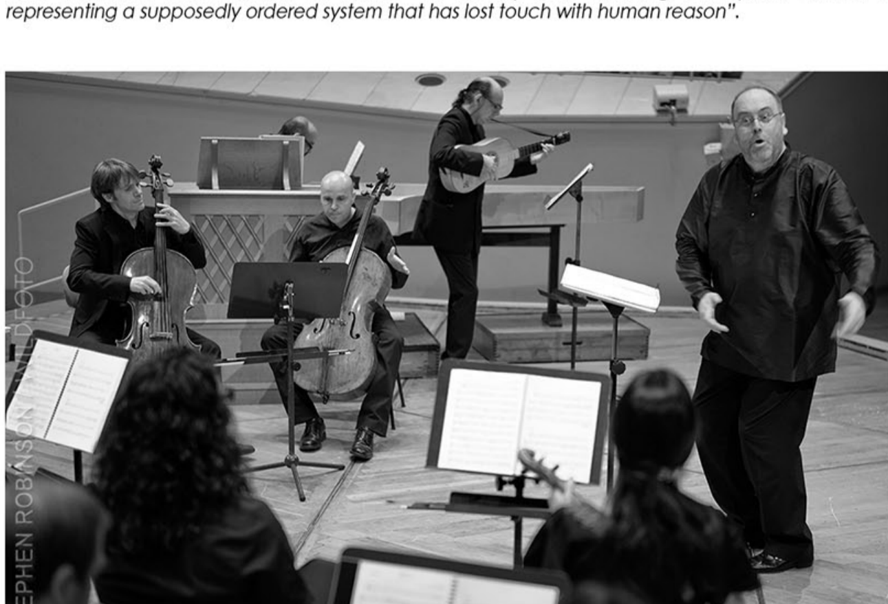
At the Philharmonie, Berlin

The Memorial to the Murdered Jews of Europe. A powerful and uneasy memorial to the six million Jews in Europe murdered by Hitler's Nazi regime during World War II. It consists of 2,711 grey concrete blocks (or "stelae") laid out in an area of 19,000 sq m in central Berlin. Each block is just 95cm distant from its neighbour, such that you walk between them alone. This large scale sculpture, by architect Peter Eisenman, was intended to create "an uneasy and confusing atmosphere aimed at representing a supposedly ordered system that has lost touch with human reason".