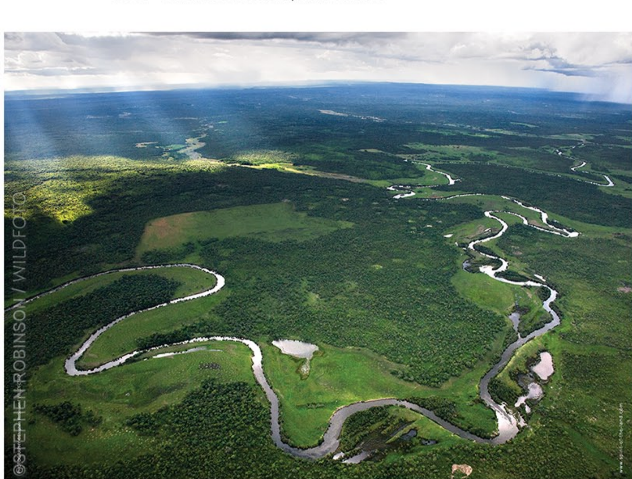
Chambeshi River, N Zambia

The reason that Zambia has so much water, is that the country sits at the juncture of two of Africa's major river systems: the Congo Basin and the Zambezi basin. The Great North Road is located roughly along a ridge between the two systems, such that, if you drive North from Kapiri Mposhi, just about all the water courses and dams on the right (East) side are part of the Zambezi system, and all those on the left (West) side are part of the Congo system. The Chambeshi River drains a huge area of Northern Zambia into the Bangweulu Swamps and Lake Bangweulu, which then drains South to form the Luapula River and then turns back North into Lake Mweru, and on eventually into the Congo River.