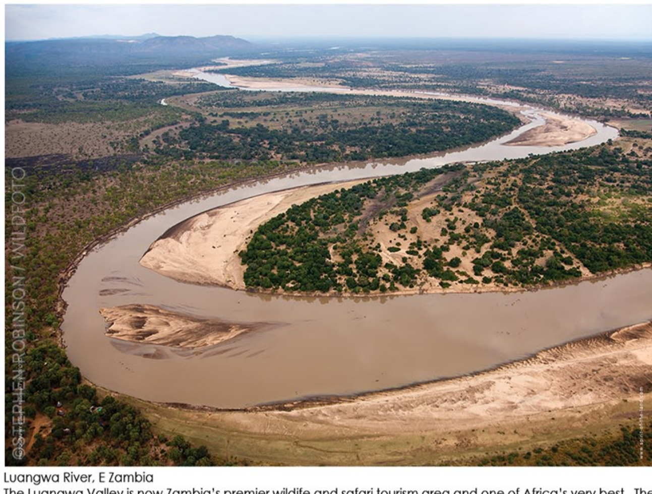
Luangwa River, E Zambia

The reason that Zambia has so much water, is that the country sits at the juncture of two of Africa's major river systems: the Congo Basin and the Zambezi basin. The Great North Road is located roughly along a ridge between the two systems, such that, if you drive North from Kapiri Mposhi, just about all the water courses and dams on the right (East) side are part of the Zambezi system, and all those on the left (West) side are part of the Congo system. The Chambeshi River drains a huge area of Northern Zambia into the Bangweulu Swamps and Lake Bangweulu, which then drains South to form the Luapula River and then turns back North into Lake Mweru, and on eventually into the Congo River.