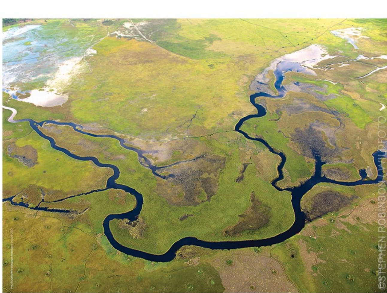
Chambeshi River Floodplain, N Zambia