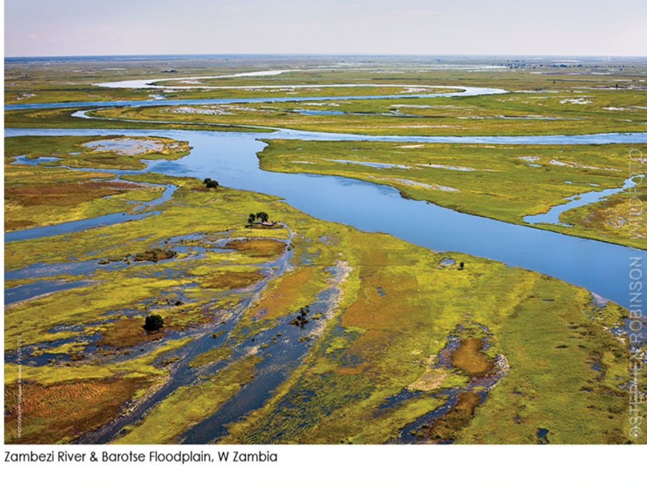
Zambezi River & Barotse Floodplain, W Zambia

From the viewpoint of providing a livelihood for the poor, the same goes: in this region some 40 million people depend entirely (100%) on the Miombo Woodland that is the forest type of the Central African Plateau region, which is some 2.4 million sq km in area. What happens when that forest is gone?