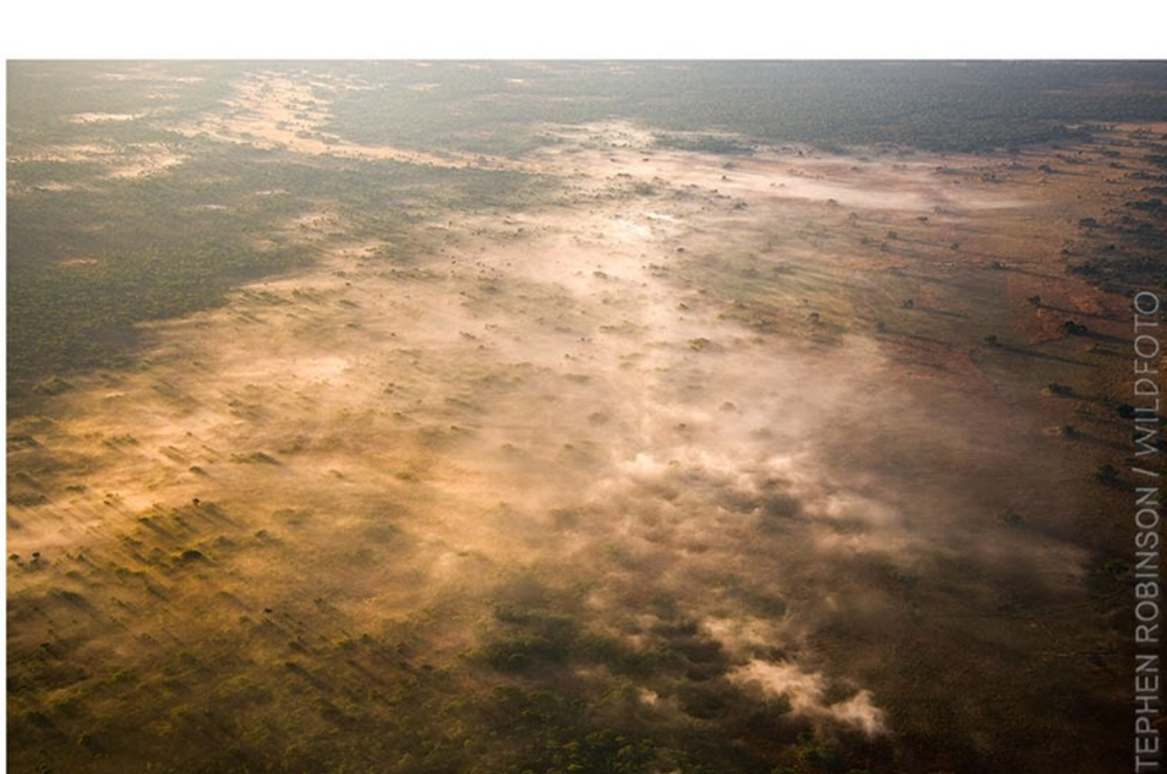
Sunrise & Dambo Mist, Miombo Woodland, N Zambia

This shot and the Bangweulu shot below are two "out-takes" from the final edit for this calendar