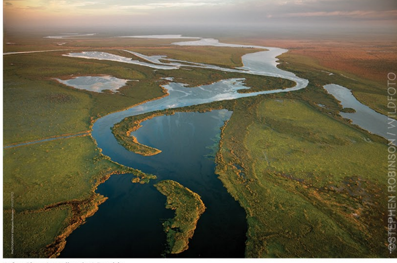
Kafue River & Wellands, S Zambia

Zambia is truly blessed with "water, water, everywhere". But there are growing concerns at the devastation caused by deforestation and the effects that this will have on Zambia's precious forest and water resources. With the current mining boom and recovering economy, we seem to be in a mad rush for "development" but with little thought and planning given to the eventual effects of schemes involving land-use change, forest clearance and hydro power projects.