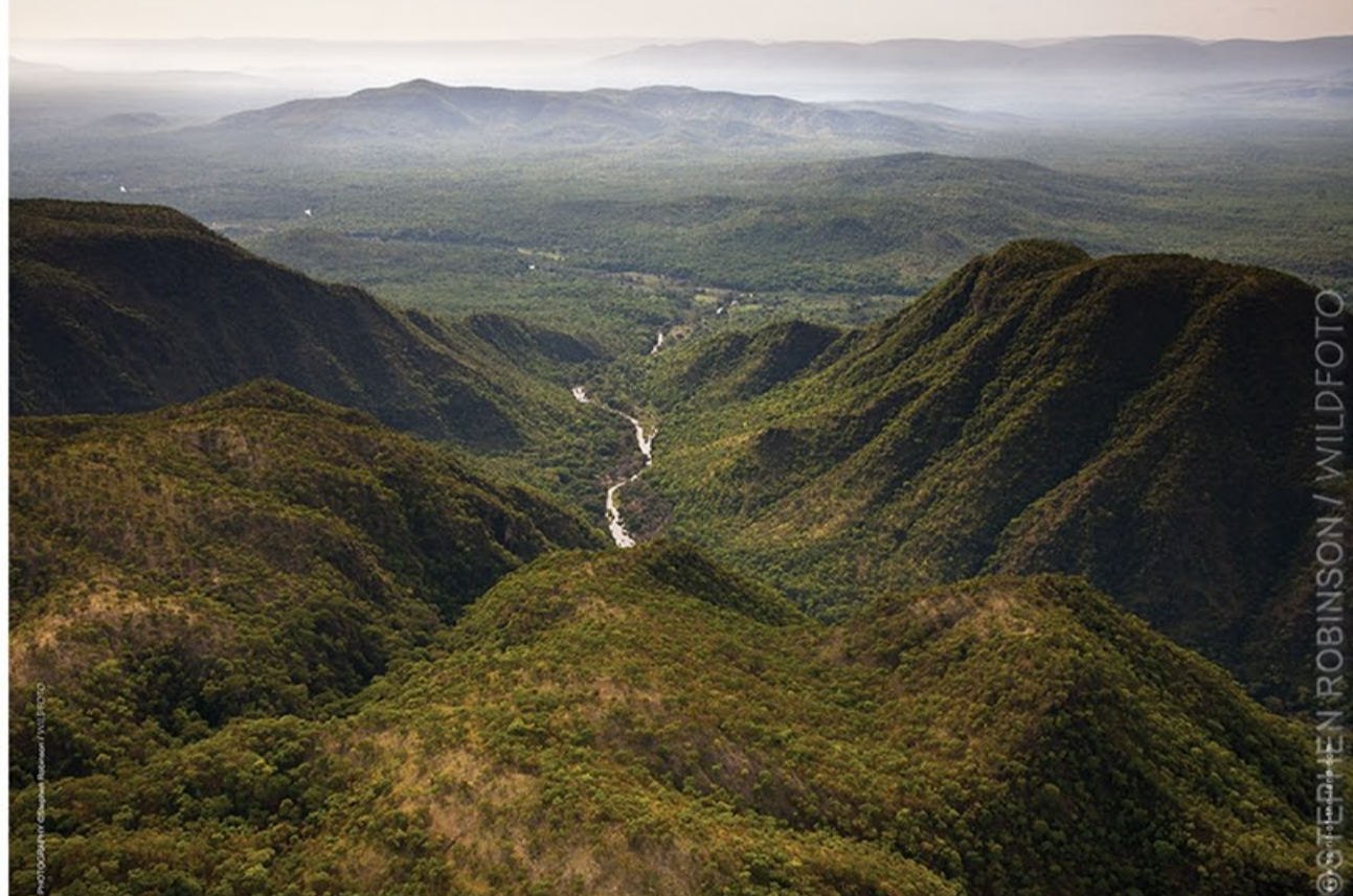
Mwomboshi River Gorge & Mwomboshi / Mulungushi Rivers Confluence, C Zambia