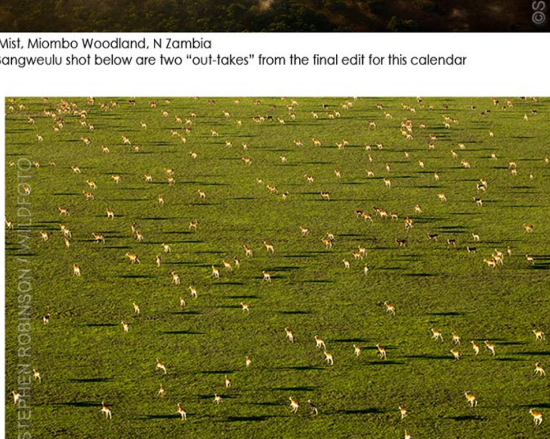
Black Lechwe, Bangweulu Swamps, N Zambia

Advertisement PHOTOGRAPHER FOR HIRE Stephen Robinson is a photographer operating from his Zambia base. He undertakes photo assignment work in the corporate, industrial, mining, donor-aid project and environmental fields, including the production of photo based communications, advertising and promotional media. This commercial work supports his nature photography speciality, including landscape, environment, conservation and wildlife work - and including his well-known panoramic photography project and exhibitions on the remote landscape, peoples and environment of Zambia. PROFESSIONAL PHOTOGRAPHY Assignments | Commercial Corporate Media | Features | Reportage Nature & Landscape | Environment Portraiture | Fine Art | Gallery Spirit of the Land FINE ART PRINTS FROM THE PROJECT ON PANORAMIC ZAMBIA www.spirit-of-the-land.com WILDFOTO Stock Photo Image Bank www.wildfotoafrica.com ENQUIRIES EMAIL: wildfoto@wildfotoafrica.com TEL: +260 966 992999