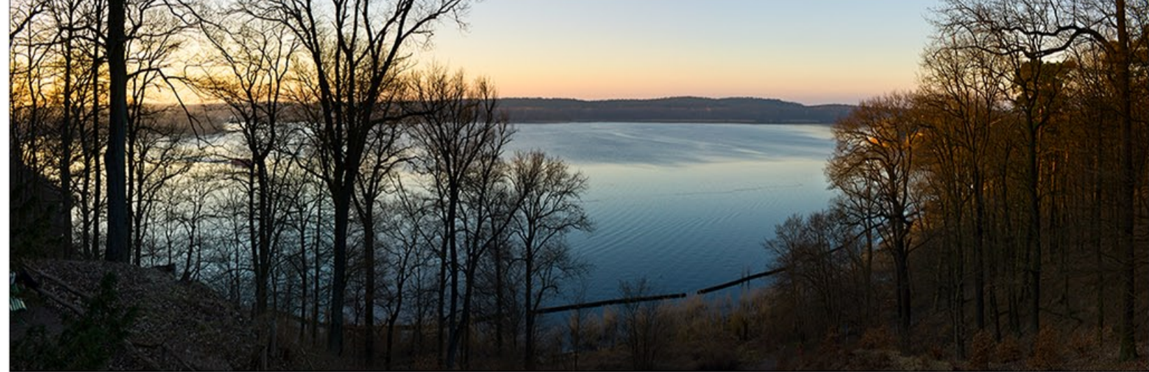
View over the Tiefer See (Havel River) at dusk, Potsdam