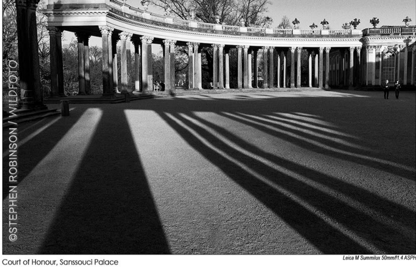
Court of Honour, Sanssouci Palace One of the two very grand colonnades enclosing the Court of Honour at the rear of the Sanssouci Palace.