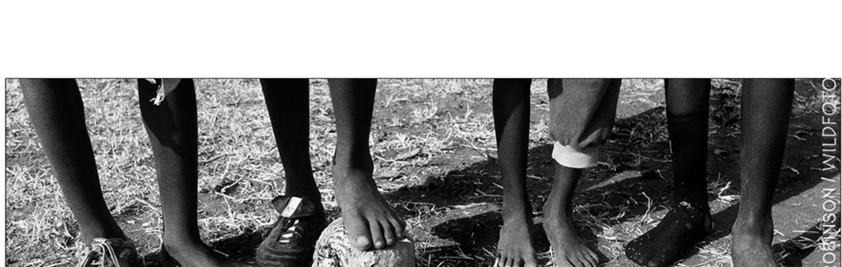
Four Players The home-made ball is called "Chimpombwa" and is made from waste plastic bags and strips of rubber from car tyre inner tubes. It bounces remarkably well. Who needs Adidas?