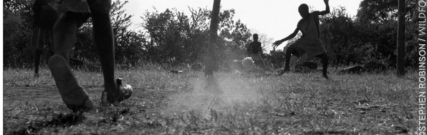
The Penalty #1 Those players lucky enough to have football boots or trainers preferred to wear only one of the pair on their "shooting" foot. They said their bare foot helps them to run faster and the boot or trainer (or sock) on the other foot enables them to shoot harder.

Some reprints of the Fine Art prints in this exhibition are now available, in addition to This Week's Print Offer (below).