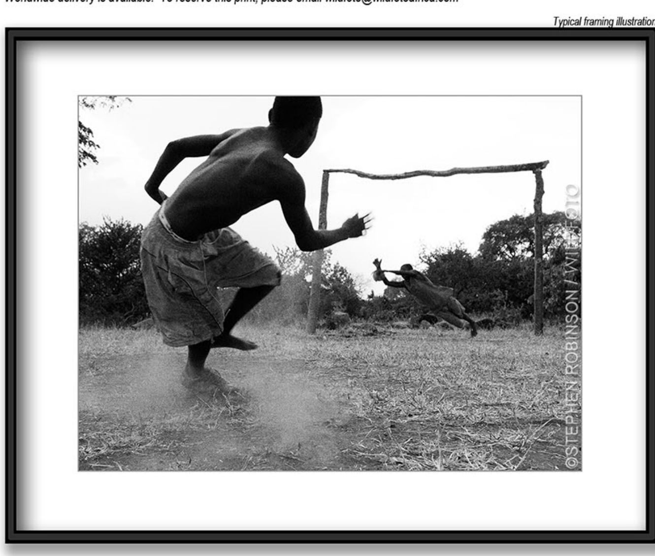
Title: The Penalty #2 from The Beautiful African Game Exhibition (ref. SZnS.BW.6946)

Edition: Signed Open Edition Print: Fine Art pigment ink printed on archival heavyweight art litho paper