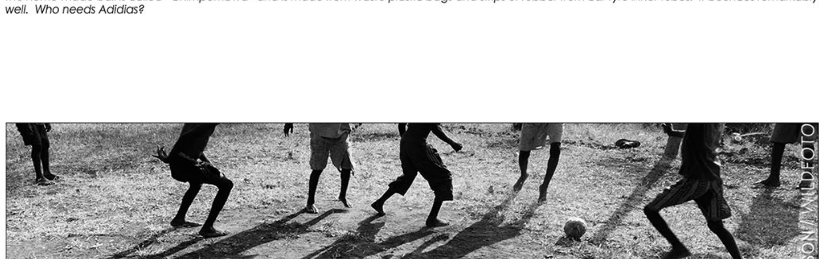
Mark Your Man