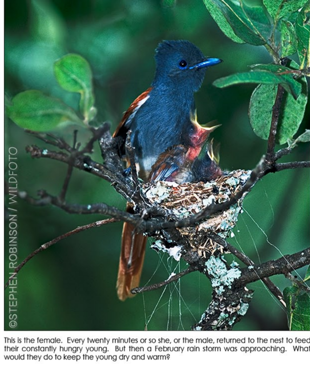
This is the female. Every twenty minutes or so she, or the male, returned to the nest to feed their constantly hungry young. But then a February rain storm was approaching. What would they do to keep the young dry and warm?