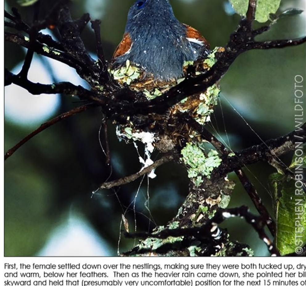
First, the female settled down over the nestlings, making sure they were both tucked up, dry and warm, below her feathers. Then as the heavier rain came down, she pointed her bill skyward and held that (presumably very uncomfortable) position for the next 15 minutes of heavy rainfall. I could only guess that this must have helped the rain run down her body and over the edge of the nest. I have never found any mention of such behaviour in bird books, nor in the internet searches done. Perhaps one of the ornithologists out there can enlighten us about this aspect of the secret lives of birds?