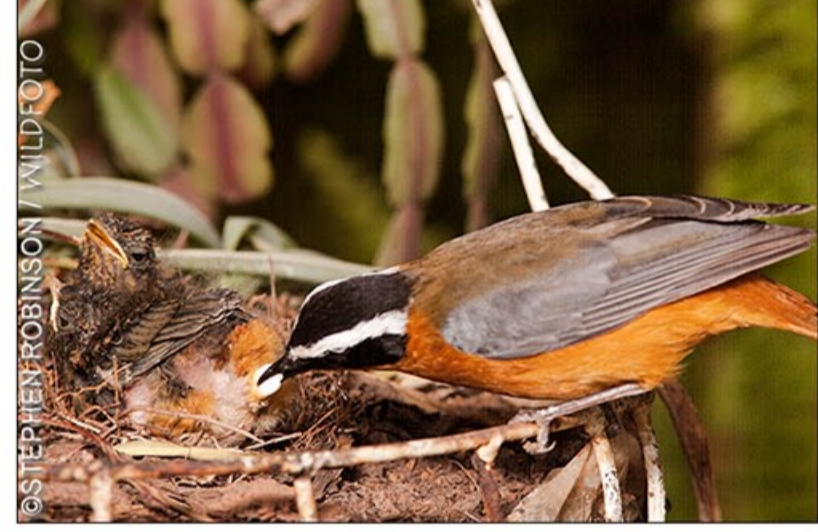
.....and the parent helps.....