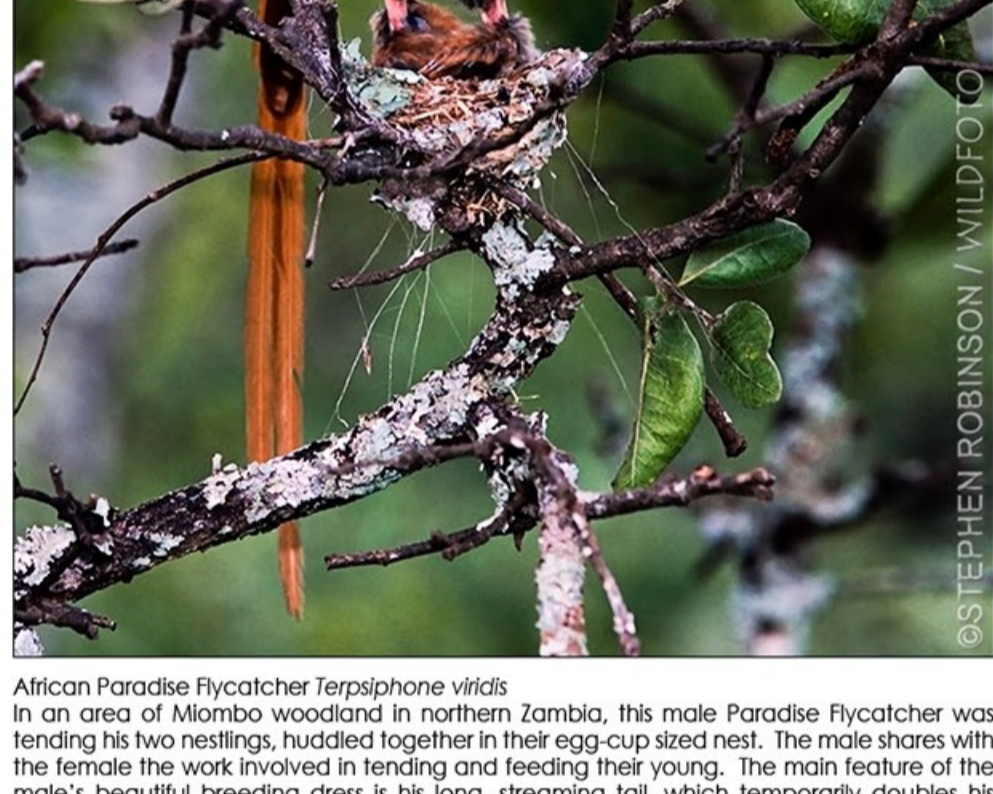
African Paradise Flycatcher Terpisiphone viridis In an area of Miombo woodland in northern Zambia, this male Paradise Flycatcher was tending his two nestlings, huddled together in their egg-cup sized nest. The male shares with the female the work involved in tending and feeding their young. The main feature of the male's beautiful breeding dress is his long, streaming tail, which temporarily doubles his length to about 34cm (13") and seems to cause him some difficulty in flight.