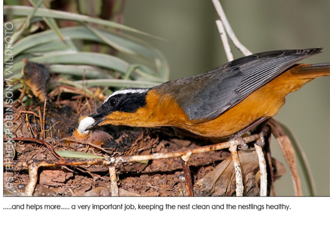
.....and helps more..... a very important job, keeping the nest clean and the nestlings healthy.