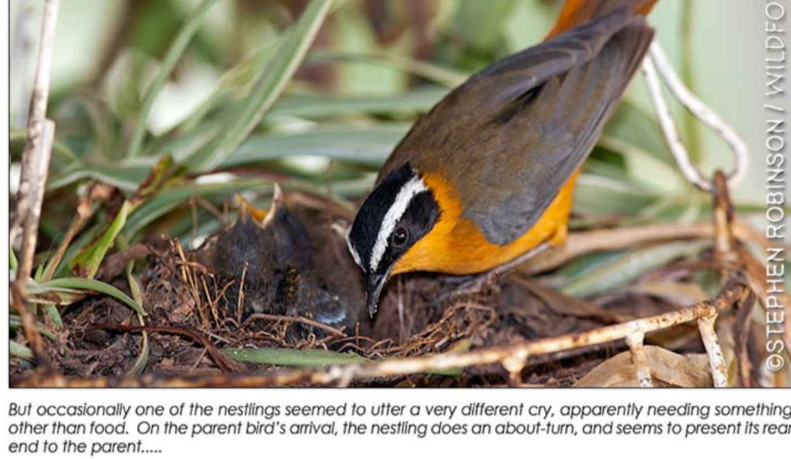
But occasionally one of the nestlings seemed to utter a very different cry, apparently needing something other than food. On the parent bird's arrival, the nestling does an about-turn, and seems to present its rear end to the parent.....