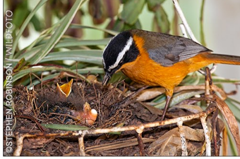
Yes, it's Toilet Time.....