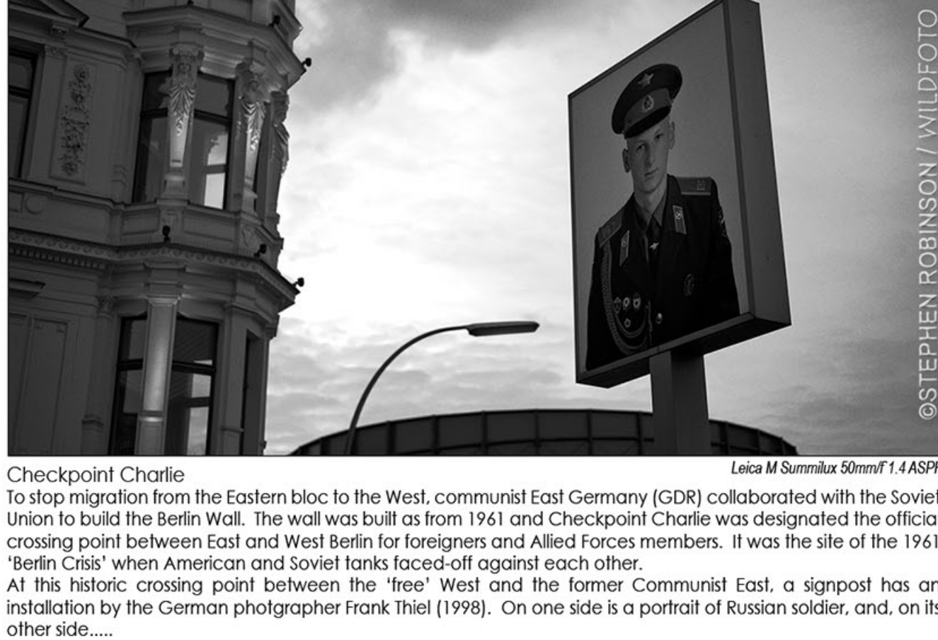
Checkpoint Charlie To stop migration from the Eastern bloc to the West, communist East Germany (GDR) collaborated with the Soviet Union to build the Berlin Wall. The wall was built as from 1961 and Checkpoint Charlie was designated the official crossing point between East and West Berlin for foreigners and Allied Forces members. It was the site of the 1961 'Berlin Crisis' when American and Soviet tanks faced-off against each other. At this historic crossing point between the 'free' West and the former Communist East, a signpost has an installation by the German photographer Frank Thiel (1998). On one side is a portrait of Russian soldier, and, on its other side.....