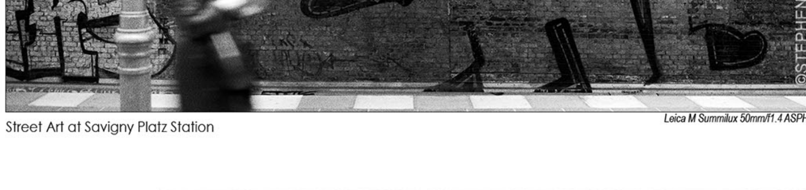
Street Art at Savigny Platz Station