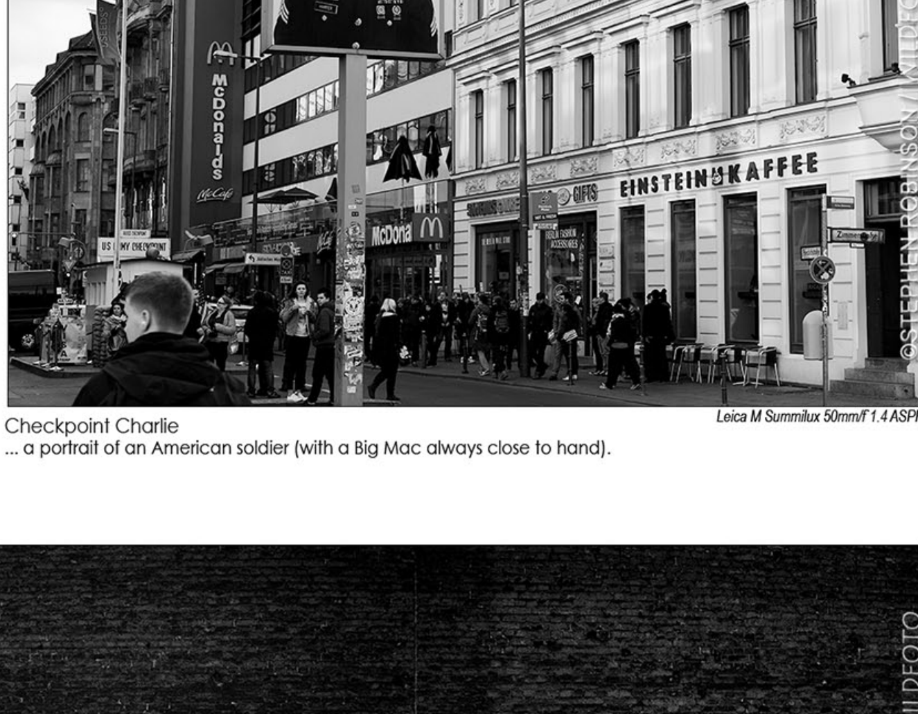
Checkpoint Charlie ... a portrait of an American soldier (with a Big Mac always close to hand).