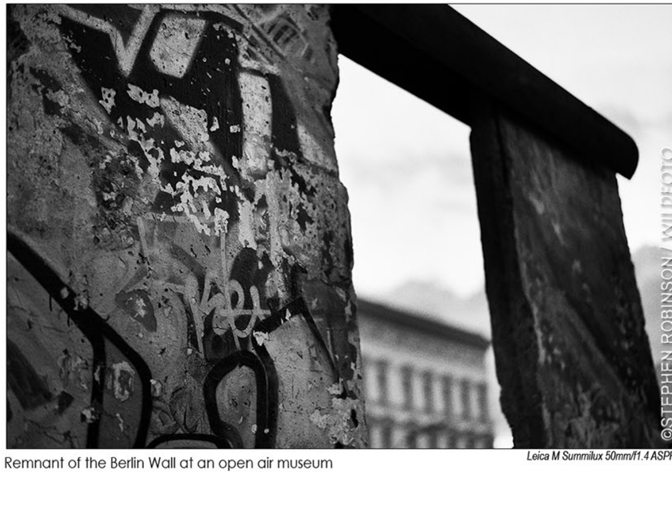
Remnant of the Berlin Wall at an open air museum