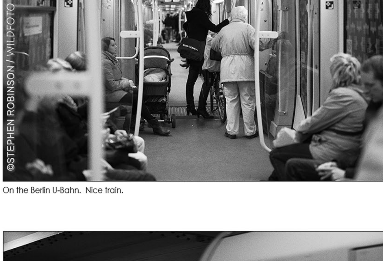
On the Berlin U-Bahn. Nice train.