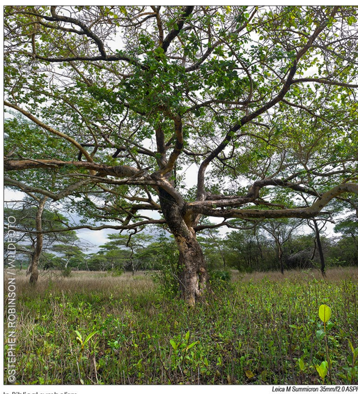
In Biblical symbolism The Sycamore Fig, also known as the "Mulberry Fig", was regarded as the "seed of God". In particular, the typically cruciform shape of its wide-spreading main branches is noted in Christian symbolism - the tree was seen as mimicking a crucifix and it seemed to rise from the earth and reach out toward heaven. The figs of this tree have been claimed to be the 'forbidden fruit' taken by Eve, and its leaves those which Adam & Eve used to 'cover' themselves.