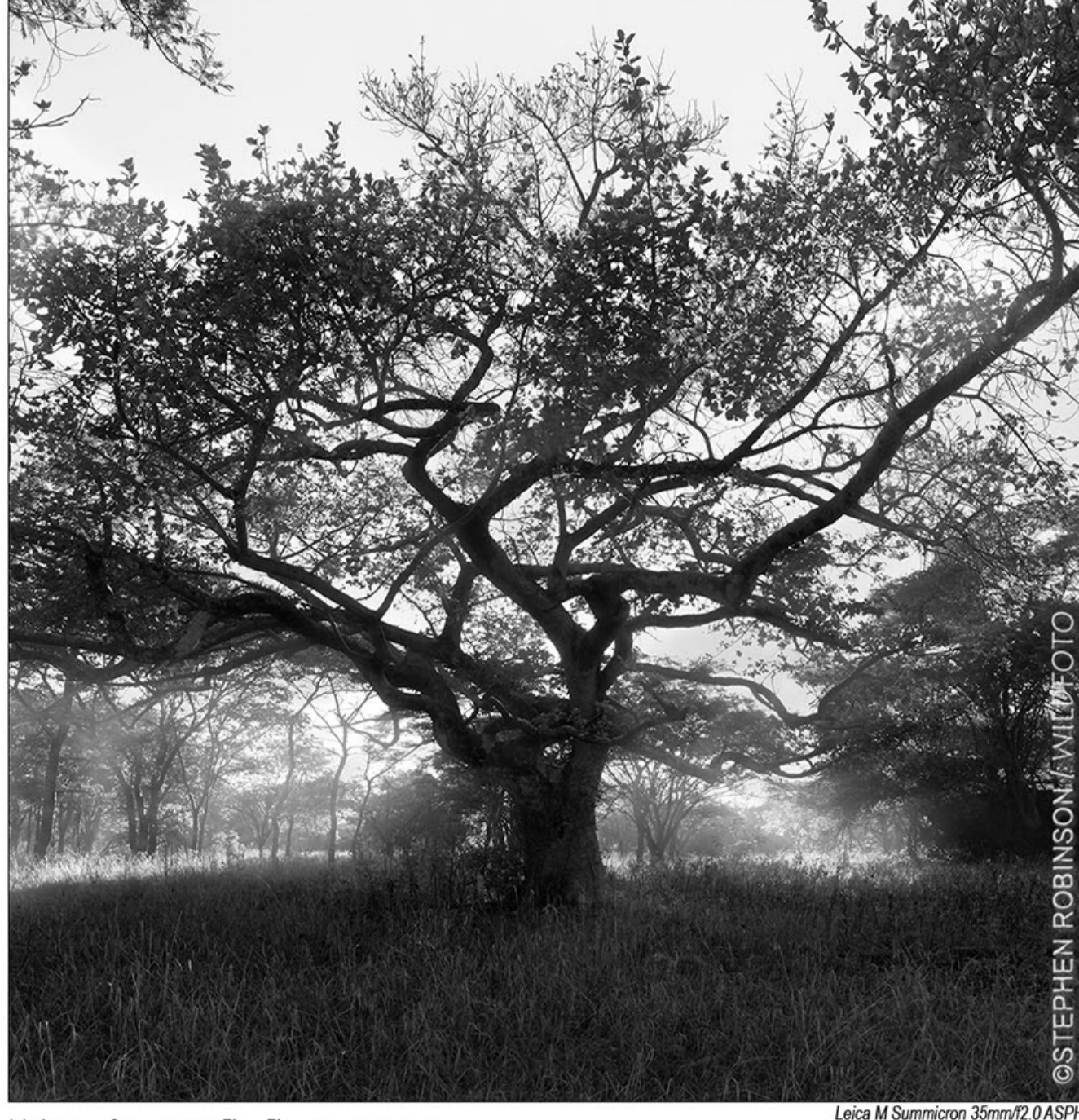
Mukuyu - Sycamore Fig, Ficus sycomorus Africa's "Queen of Trees" is thought to have existed since 'the dawn of history' - this Ficus genus of trees dating back some 60 million years.

In this PhotoMail, the first in a PhotoMail series on remarkable trees.