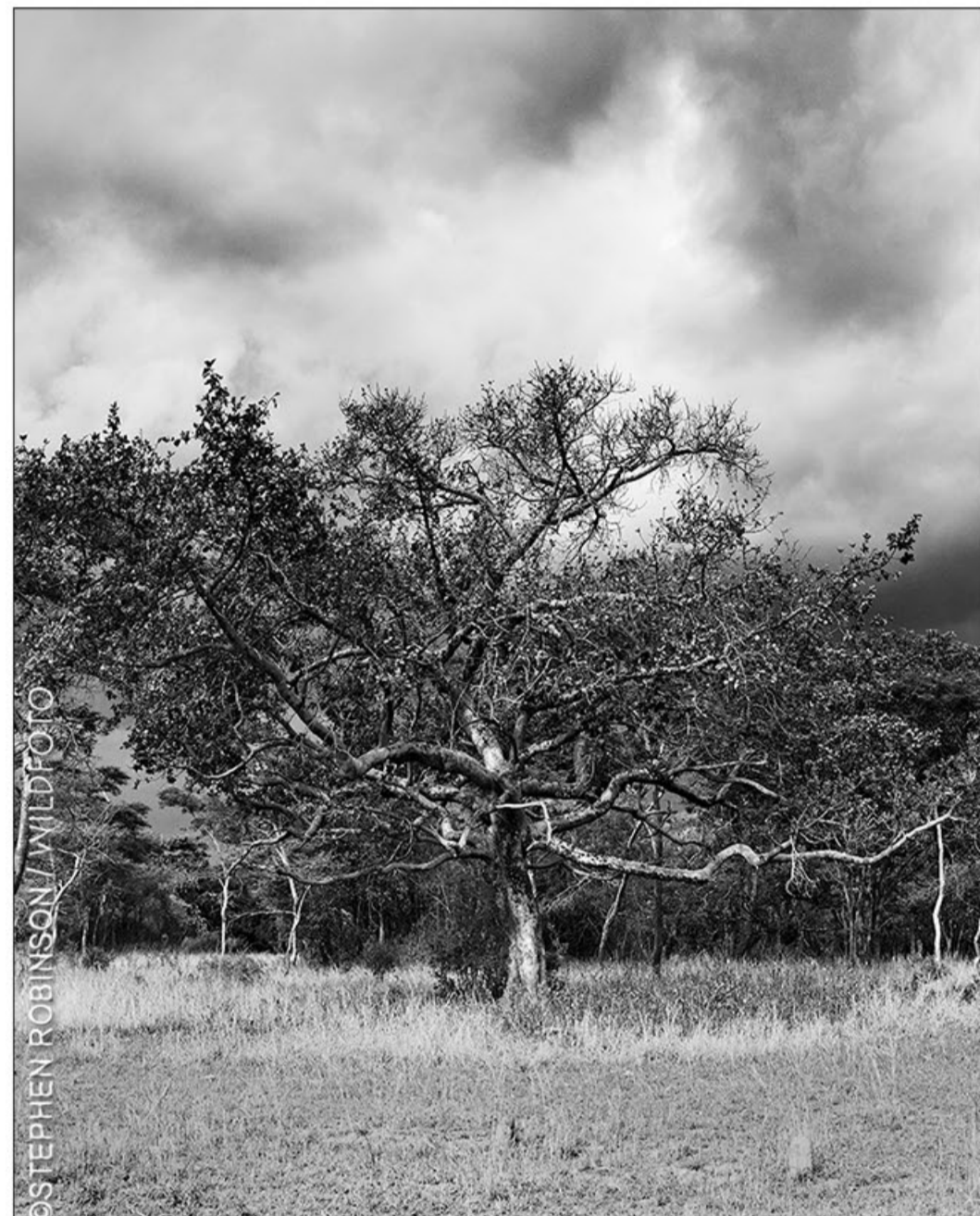
But this Queen has a consort so unusual that they make a very odd couple - for this large tree's suitor is a liny, 1.5mm-long wasp. Their relationship is exclusively symbiotic, the life cycle of each of them being totally dependent on the other's. The liny wasp, called the Fig Wasp Ceratosolen arabicus , is so small that it is wind-blown from tree to tree. A Durham University study in Namibia found that the pollinating wasps are transported from tree to tree by 'riding the winds' for up to 160km, and perhaps much further afield.

Its wide-spreading branches and thick, large-leaved foliage make it a good shade tree. The dried figs have been noted to take on a sultana-like flavour and in Angola the fruits have been used to distill a gin-like spirit. Its bark is used to make rope and a concoction made from the leaves is used in traditional medicine to stimulate milk production in humans and cows.