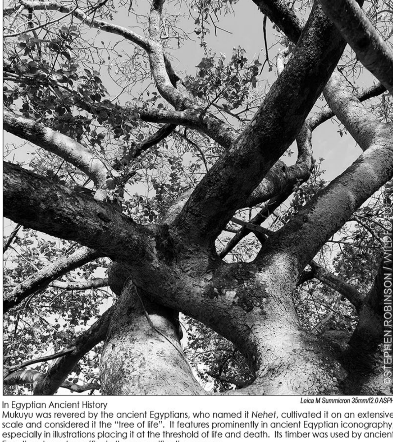
In Egyptian Ancient History Mukuyu was revered by the ancient Egyptians, who named it Nehet, cultivated it on an extensive scale and considered it the "tree of life". It features prominently in ancient Egyptian iconography, especially in illustrations placing it at the threshold of life and death. Its timber was used by ancient Egyptians to make coffins in the mummification process.