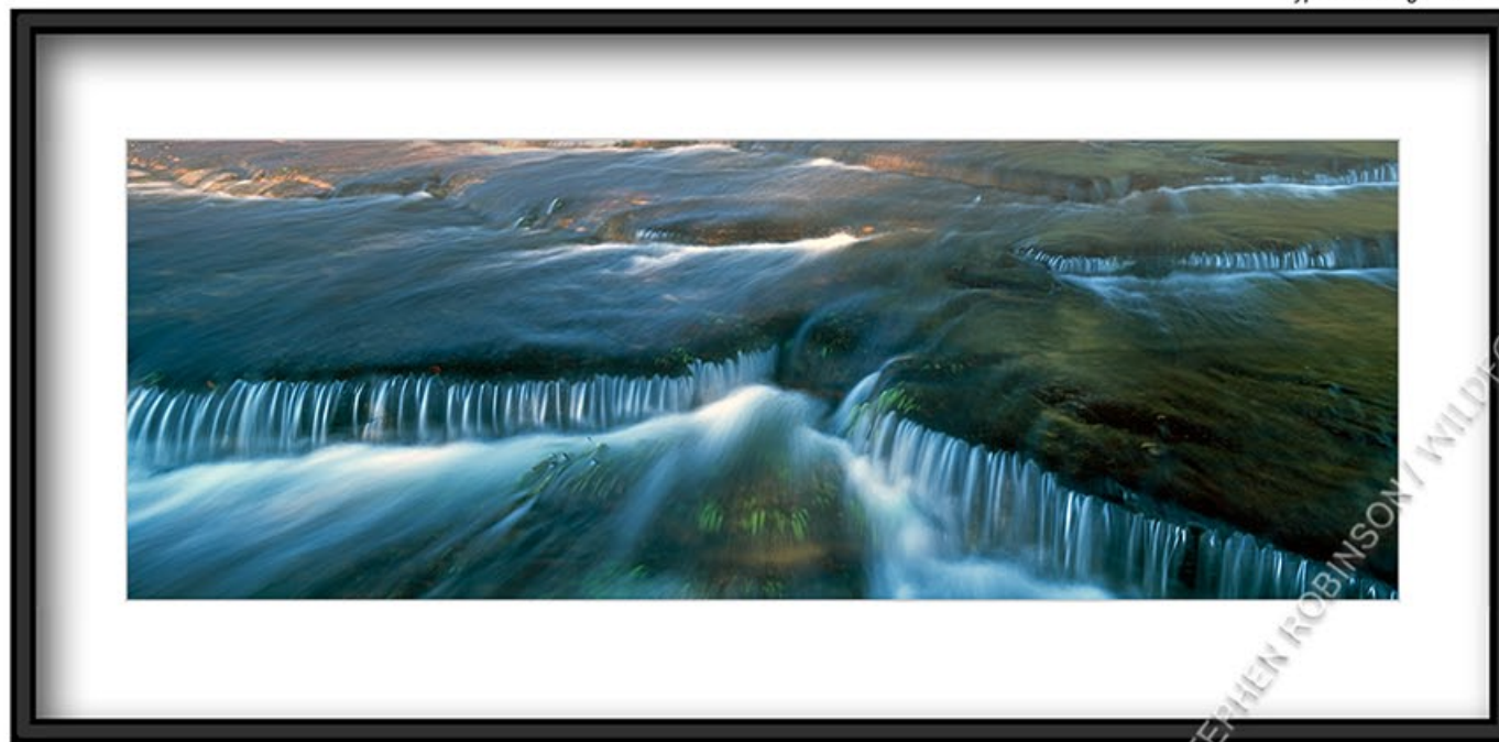
Title: River Abstract Kalungwishi River, N Zambia (ref. LZmL268)

Edition: Signed Edition Print: Fine Art pigment ink printed on archival heavyweight art media, matted & solid wood framed Framed size: 86cm x 48cm (34"x19") Price: Gallery price - US$240 OFFER price - US$150 one only