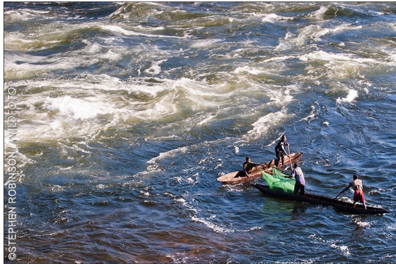
Fishing with donor aid mosquito nets, Luapula River, D R Congo/Zambia border Donor-aided anti-malaria bed nets, intended to save lives, are used by fishermen such as these and in villages and towns to make fencing in chicken runs. Also, the white nets are used to make wedding dresses.

Uncontrolled and unsustainable fishing with small aperture gill nets is threatening even big rivers such as this on the D R Congo/Zambia border. Now, netting using anti-malaria bed nets donated by international aid agencies is widespread (see picture below from the same area) and this exacerbates an already serious problem - such nets removing not just small fish but also all fingerlings and even the fish eggs, thus quite literally killing a once rich river and threatening the health and survival of many riverside populations.