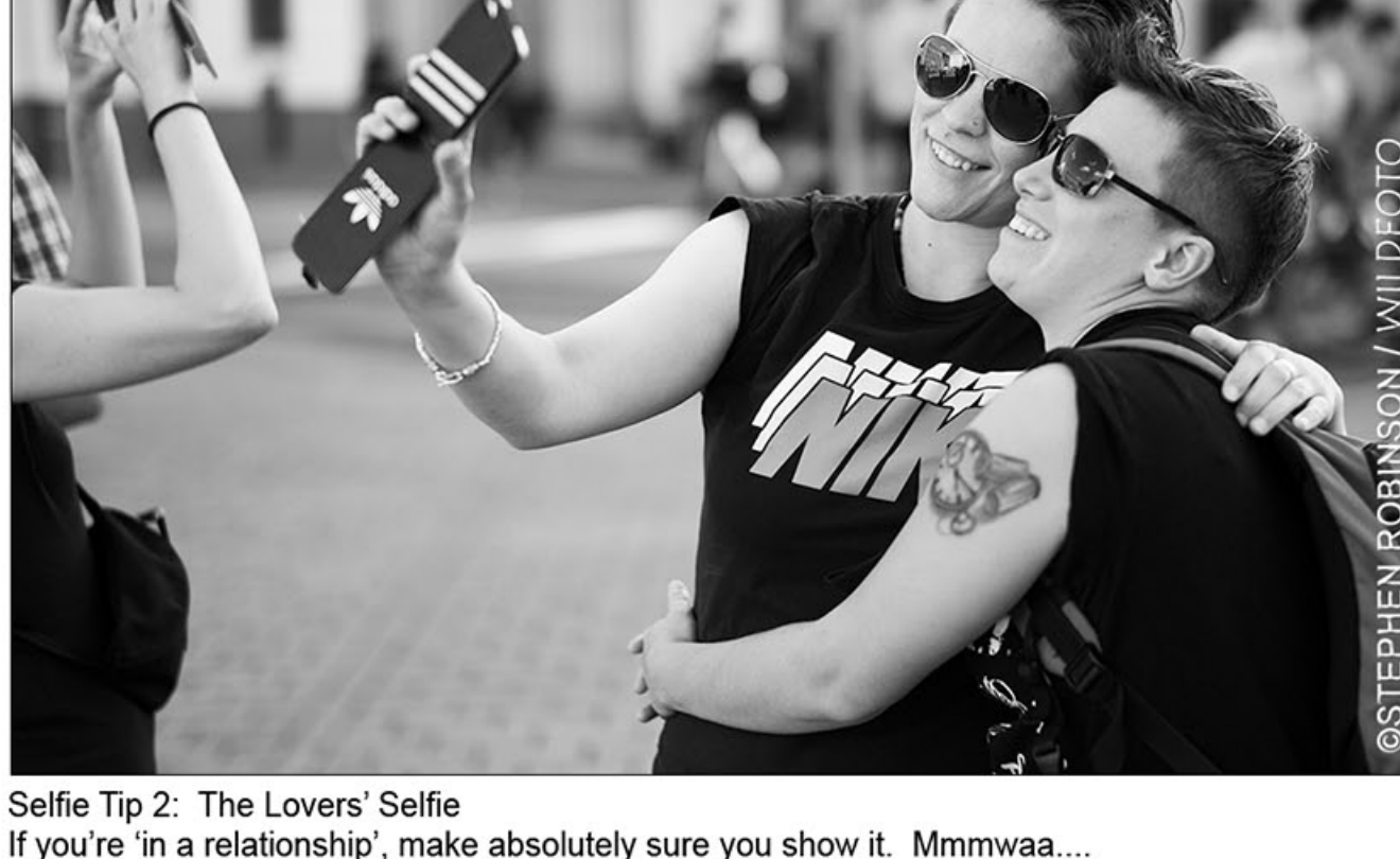
Selfie Tip 2: The Lovers' Selfie If you're 'in a relationship', make absolutely sure you show it. Mmmwaa.... But don't try this in Zimbabwe.