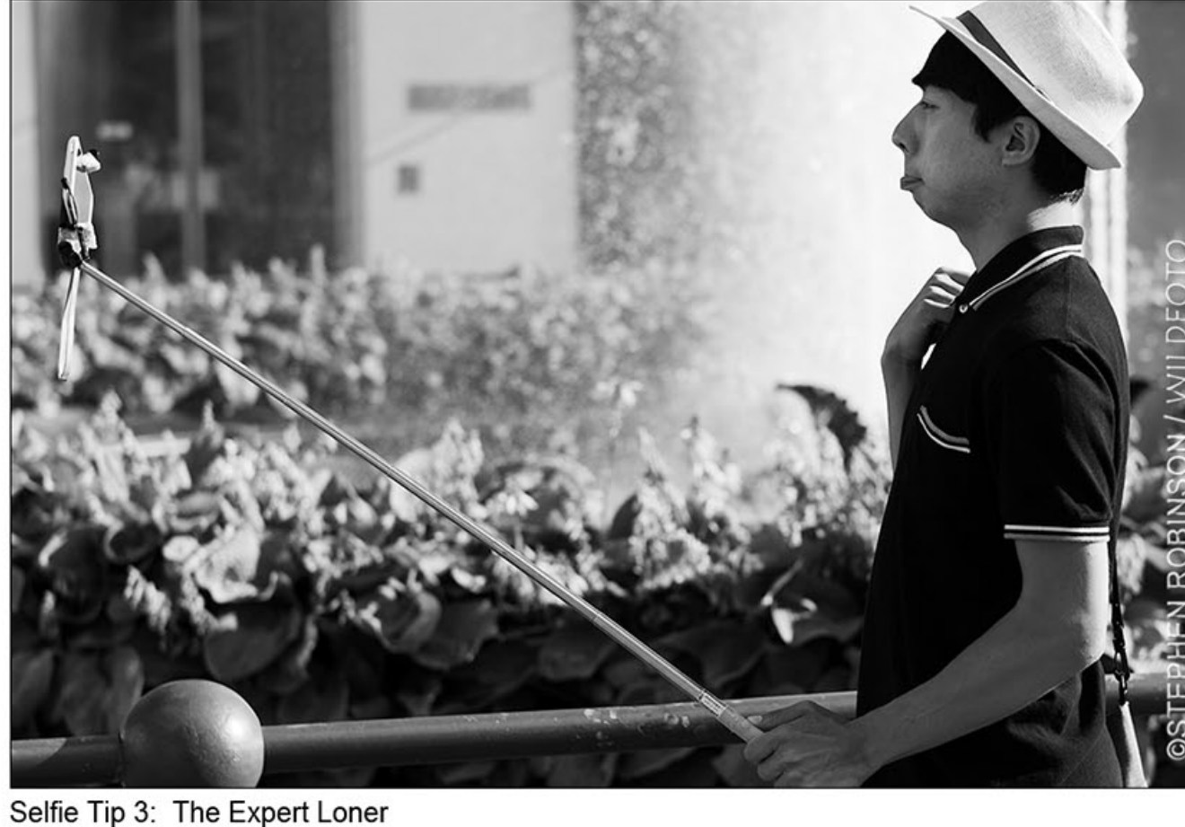
Selfie Tip 3: The Expert Loner Alone but undaunted, the Expert Loner has a large repertoire of dynamic expressions and poses.