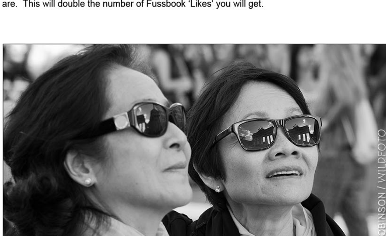
Selfie Tip 7: The Selfie Virgins Although now very rare, look out for the Selfie Virgins. They are the ones interested only in looking at the landmark, the architecture, or learning about its history in a tourist guide book. Don't let them distract you from your Selfie objective. If they are obstructing your Selfie, get your selfie stick out and stand between them and the landmark. They will soon move out of your way.