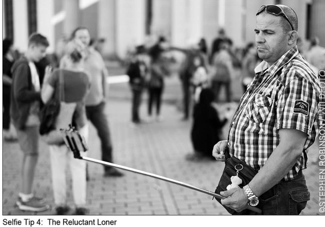
Selfie Tip 4: The Reluctant Loner