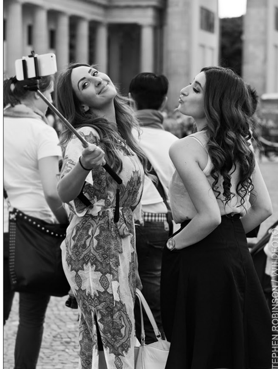
Selfie Tip 5: The Selfie Masters Advanced exponents of The Art of the Selfie tour the World's most iconic landmarks, always impeccably dressed, designer-accessorised, and ready to strike one of their well-rehearsed poses. It's said that some of them have more Fussbook 'friends' than Mark Zuckerberg has dollars.