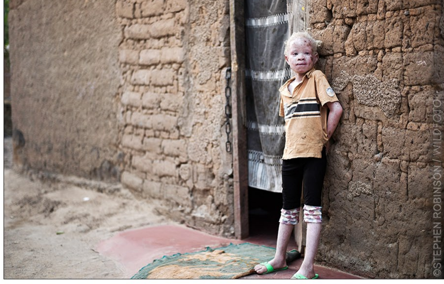
"I didn't know how to take care of her - I was selling vegetables with her on my back without knowing that I am damaging her skin. I am staying in a very small house with no plaster, so flies and mosquitoes are biting her. As a result she started having sores, rashes and ringworms etc. That's how the problem of the skin started, as young as she is."