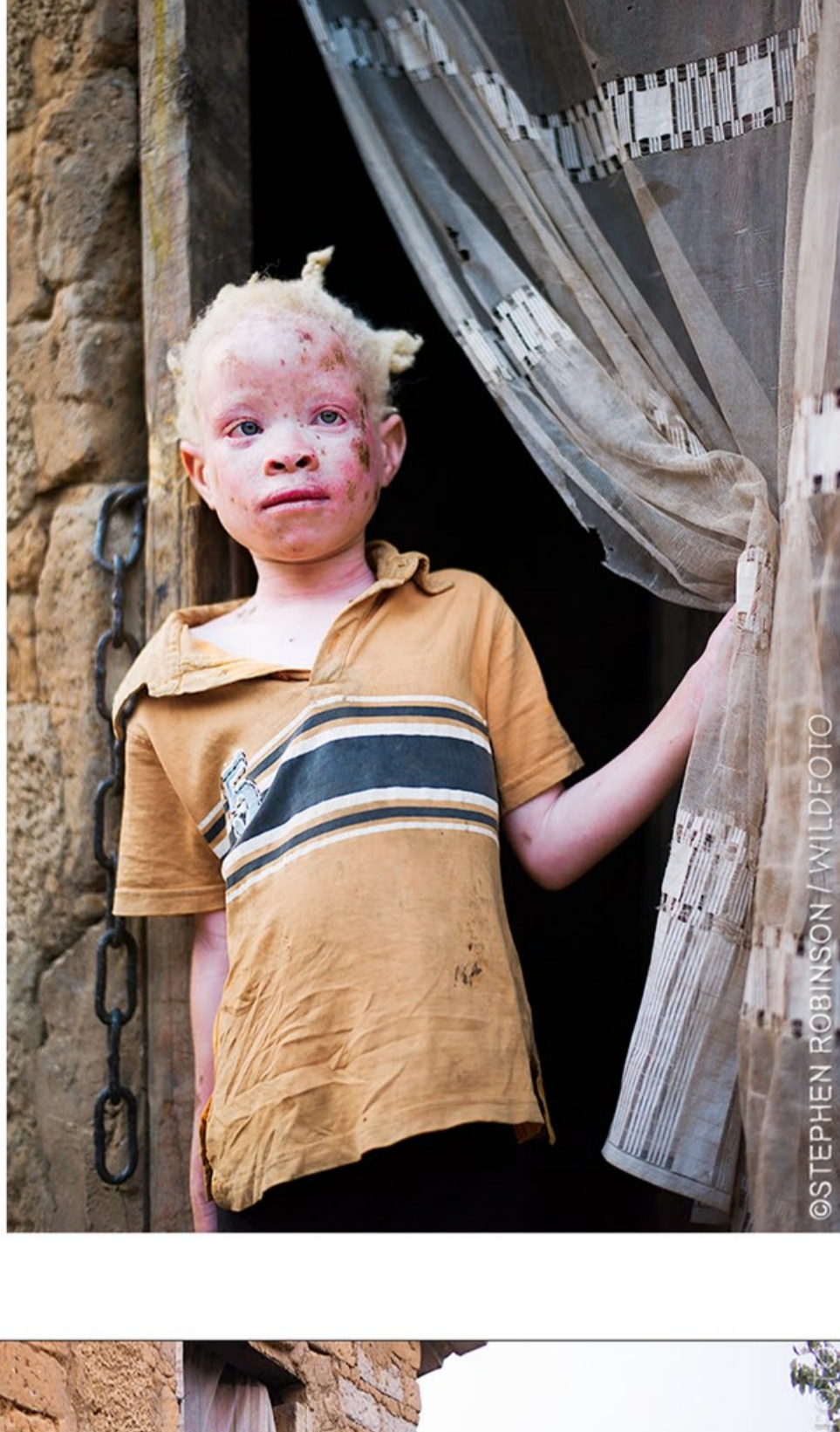
"...people say that for me to have an albino I am cursed including the baby. I am being laughed at and the child too. They're calling her names that she looks like an animal because of the dotted skin. Some are calling her a woollen doll etc."