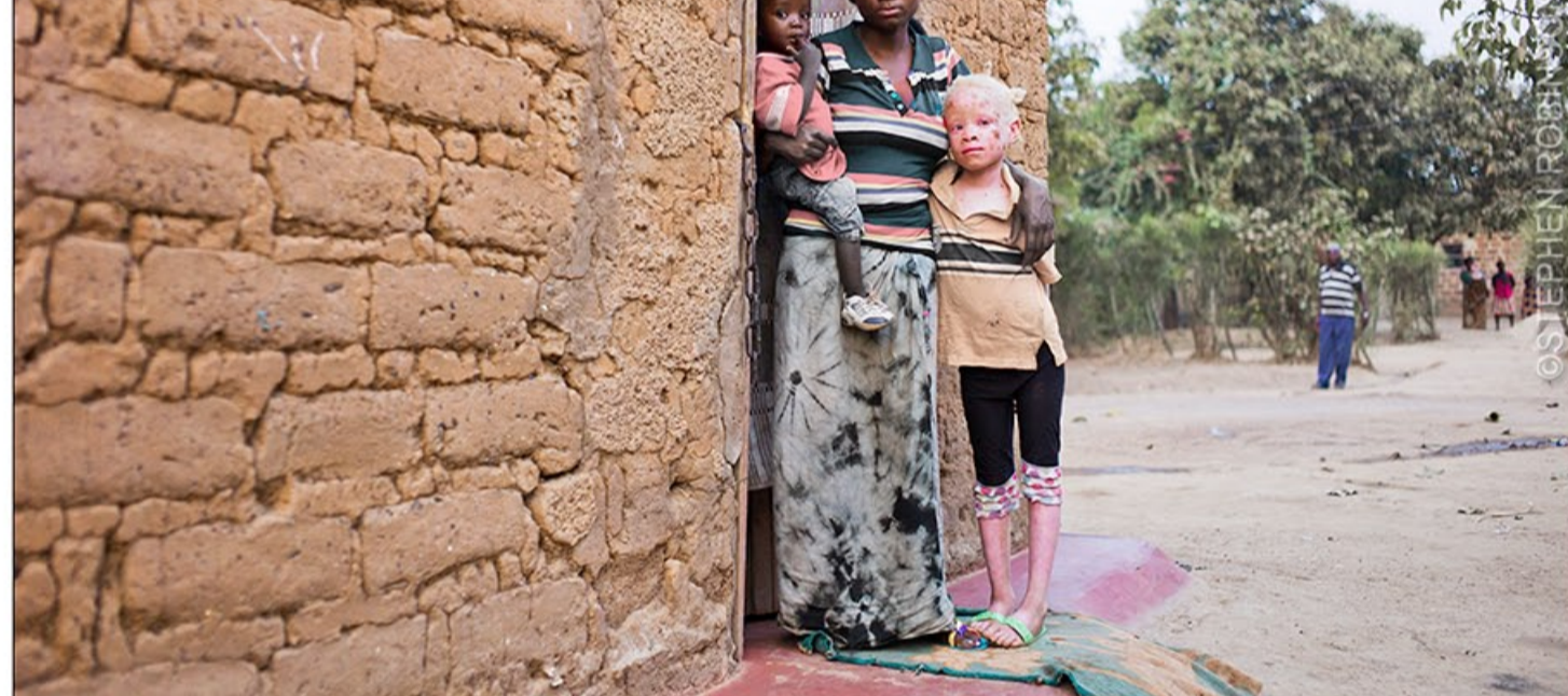
"My family cannot eat with my albino girl. They cannot share anything like cups, spoons, bath tubs etc. they say her mouth looks like a pig, so they can't share anything with her. She's being neglected by my own family and her father. As she was coming out to urinate it was night time. People screamed at her thinking she was a ghost."